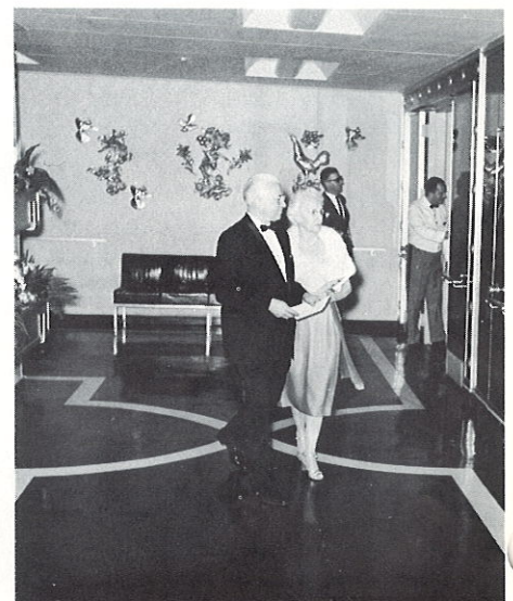
The beauty of a very fine and modern ship.