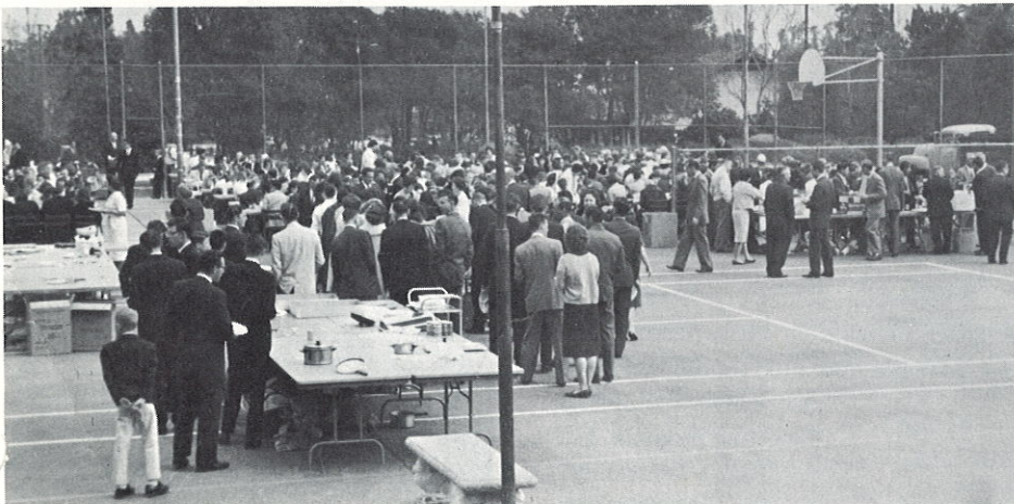
Southland brethren assemble for feasting and fellowship.